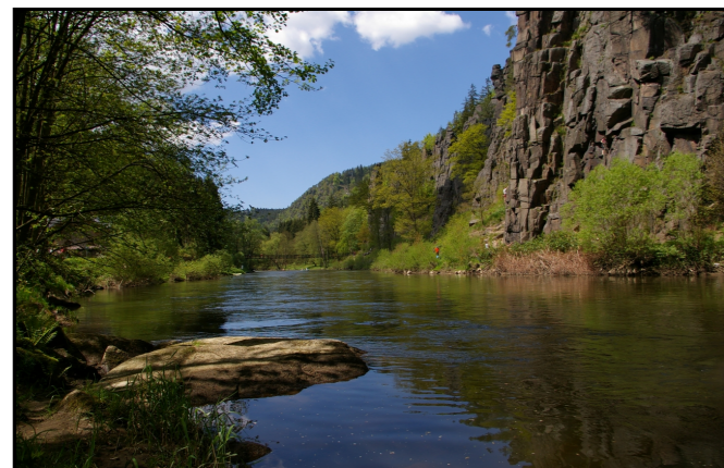
The Svatos Rocks